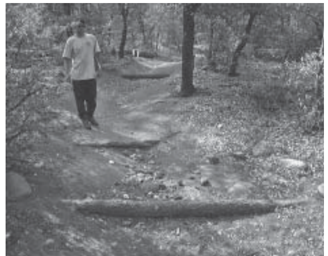
Crew member inspecting installation of water bars

Volunteers built the Turley Trail in 1993 on an easement purchased from the State Land Department with a grant from Arizona Game & Fish Department Heritage Fund. But the trail has received little maintenance since that time. About two years ago, YTA applied for a trail maintenance grant under a program administered by Arizona State Parks Department. We were successful, but various necessary clearances delayed