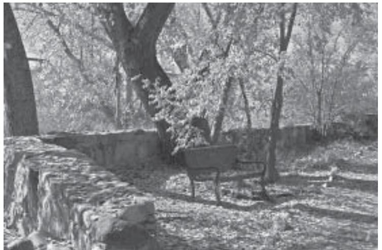
Trailside rest on West Granite Creek Trail in downtown Prescott

Additional citizen involvement on above projects is always welcomed. Contact me at eric.smith@cityofprescott.net