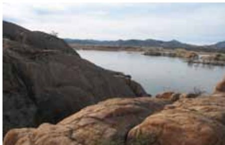
View of Willow Lake from overlook

The trail begins immediately east of the parking area near Willow Lake boat ramp. At 0.25 miles note the trail sign with an arrow for "Willow Loop Trail" pointing right. You begin a climb marked by white paint dots at 0.5 miles to a grand vista overlooking the lake. Then at 0.7 miles another sign marks the junction with neighboring trails in the area. Continue to the right as shown by the "Willow Loop Trail" arrow. A small wooden bridge spans an otherwise difficult chasm at 0.9 miles. At 1.1 miles and within sight of the Willow Lake dam, the trail veers