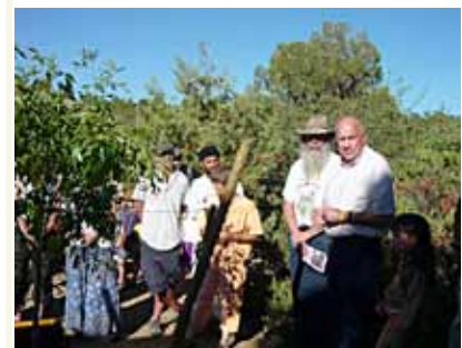
June 5 tree planting & dedication, OSA/Friends of Acker