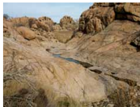
Willow Lake Dam Spillway

left and follows the course of the solid rock spillway to Willow Creek. As you enter the creek bottom at 1.2 miles there is yet another map at a switchback. Climb from the creek, passing an open meadow (private property) and follow the well-marked route back to where you started (2.4 miles).