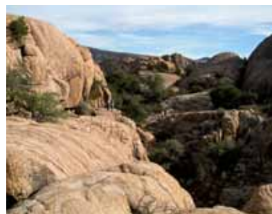
Vertical canyon walls expose unique rectangular forms