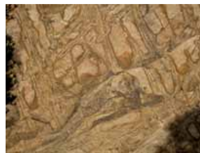
Close view of "Cinnamon Buns"

For detailed directions on this trail, maps, and much more check out the City of Prescott website article on page 4 or go to: