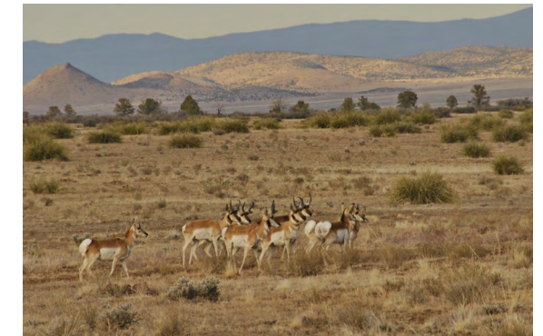
The American pronghorn has completely vanished from quad-city urban and suburban landscapes. This phenomenon is almost entirely due to the fragmentation of this species’ habitat.

impacts caused by “habitat fragmentation” due to development and roadway corridors.